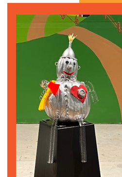
WINNER 2023 PUMPKIN CONTEST